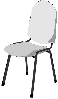
TABLE SET UP/TAKE DOWN IS $1.00 EACH IN ADDITION TO DELIVERY FEE CHAIRS